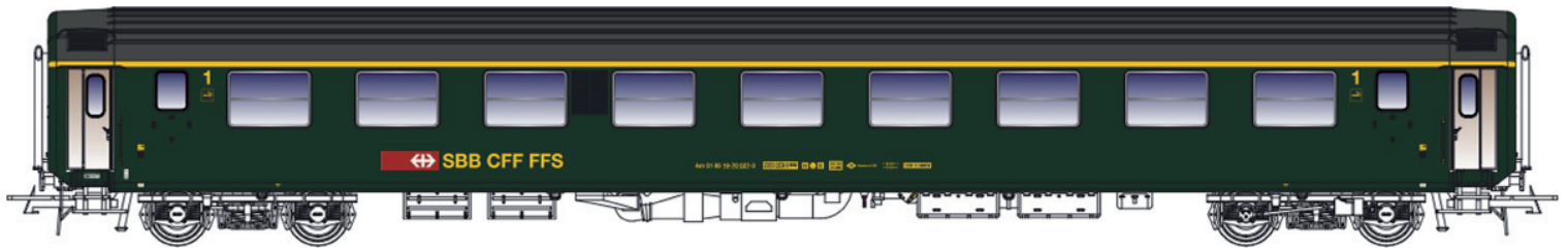
47 213 Am, green, new logo, 9 compartments, grey roof, Ep. IV