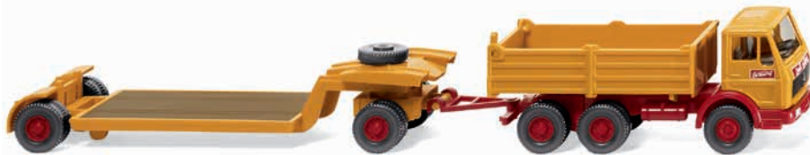
0492 01 Low-loader trailer (MB NG)