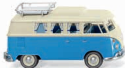
0797 33 VW T1 camper van