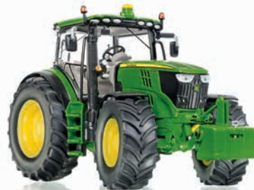
0778 36 John Deere 6250R