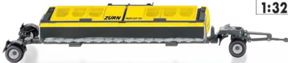
0778 38 Zürn ProfiCut 700 direct cut header with transport trailer