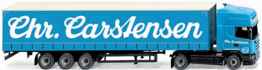
0537 09 Curtain-sided semi-trailer (Scania R420 Topline)

The multi-faceted world of the miniatures from six decades – kept alive by WIKING! The “Froschaugen” débuts with tarps, along with the VW T1 as a camper van with characteristic contemporary roof rack. Model joy is provided by the Bölling-inspired low-loader combination of the 1980s, the Saviem box semi-trailer of Brauerei Kronenbourg from Strasbourg