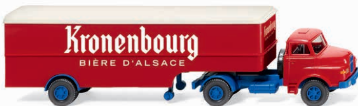
0513 22 Box semi-trailer (Saviem)