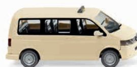
0308 08 Taxi – VW T5 GP Multivan