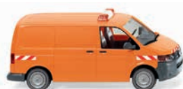
0309 07 Municipal - VW T5 GP box van