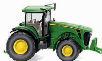
0391 02 John Deere 8430