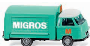
0279 01 Sales vehicle (Borgward)