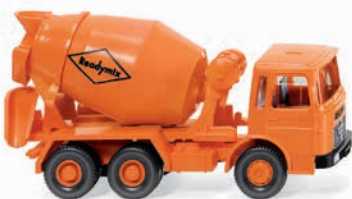
0682 04 Concrete mixer (MAN)