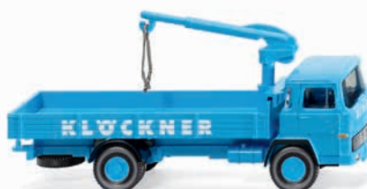
0423 01 Flatbed lorry (Magirus 100 D7)