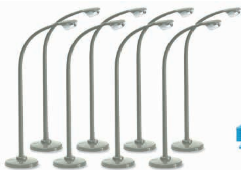
0018 21 Accessory pack - street lighting (Content: 16 pieces)