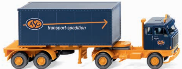
0526 02 Container semi-truck 20' (Volvo F89)