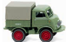
0368 02 Unimog U 401