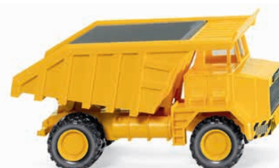
0866 02 Tipper trailer (Kaelble KV 34)

It is the most powerful John Deere that WIKING has so far miniaturised on the 1:87 scale. The John Deere 8430 has gained itself a spotless reputation as a powerful tractor in large-scale agriculture with the corresponding model impressing with its dimensions alone. In contrast, the MAN 4R3 from the years of the agricultural economic miracle appears rather modest. True to the era, WIKING teams it with the Mercedes-Benz 180 - for the first time with an interior - as a fire chief's car. The VW Beetle 1200 with open