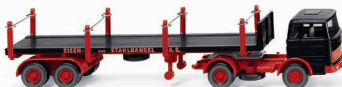
0518 45 Stanchion trailer truck (MB 1620)