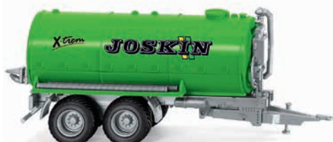
0382 38 Joskin vacuum barrel trailer