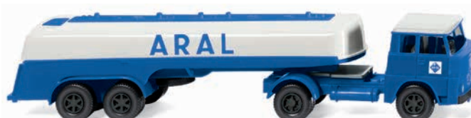
0806 98 Tanker truck (Henschel HS 14/16)