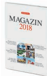
0006 25 WIKING-MAGAZINE 2018

The legendary Italian roadster has been immortalised as a WIKING model! With the design of the Alfa Spider, brain child of iconic designer Pininfarina, WIKING consciously prescribed a new design vocabulary – the details are intricately reproduced. The traditional model maker is also taking the wraps off a BMW 2002 in the service of the Free State of Bavaria, which faithfully replicates the look the Bavarian police gave their vehicles at the time. Also making their debut are the Mercedes-Benz LP 2223 as a high-sided flatbed truck with loading crane, the Krupp Ardelt sporting a scrap