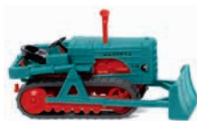
0844 37 Hanomag K55 crawler tractor