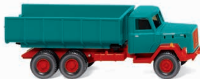
0645 03 Dump truck (Magirus)