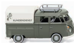
0789 05 VW T1 crew cab