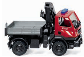
0601 31 Fire brigade – Unimog U 20 with loading crane