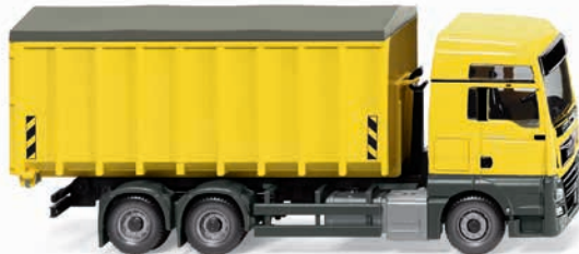
0672 05 Roll-off dump (MAN TGX EURO 6c/Meiller)