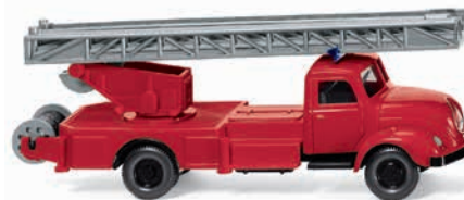
0620 02 Fire brigade – Turntable ladder (Magirus S 3500)