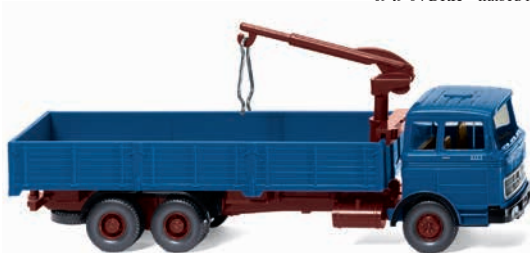
0433 07 High-sided flatbed truck (MB LP 2223)