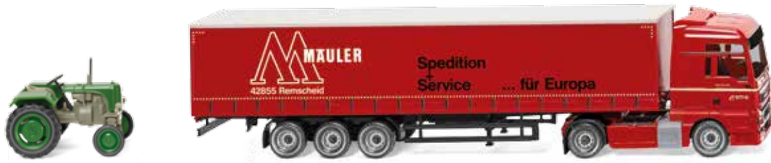
0876 48 Steyr 80