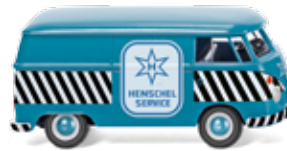
0797 16 VW T1 panel truck