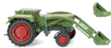
0890 03 Fendt Farmer 2S with front loader