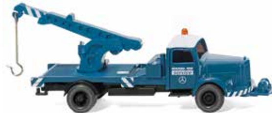
0421 01 Mobile crane (MB L 3500)