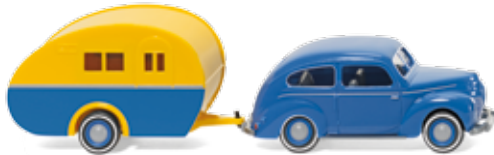
0820 04 Ford Taunus G73A with trailer