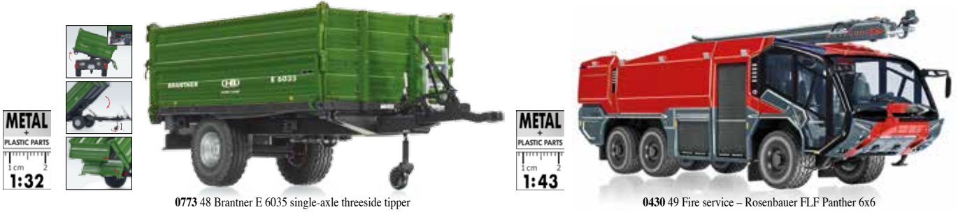
0773 48 Brantner E 6035 single-axle threeside tipper