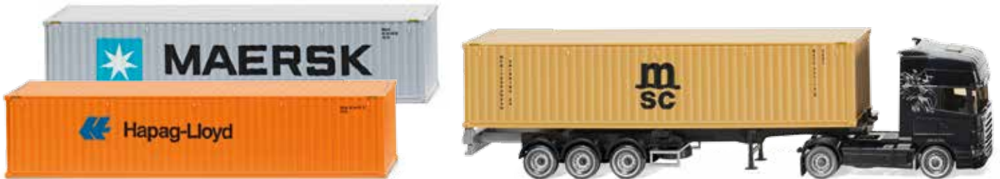
0018 13 Accessories package – 40' container (NG)