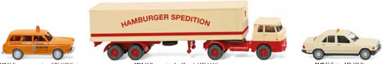
0042 01 Emergency service – VW 1600 Variant