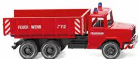
0624 02 Fire service - dumper truck (Magirus Deutz)