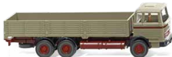
0433 03 High-sided flatbed truck (MB)

In 1:87 scale, a reunion takes place with such beautiful classics as the legendary Mercedes-Benz C 111 as well as the Mercedes-Benz L 3500 as service crane truck. The VW T1 appears in the former colors of the Henschel customer service. The Mercedes-Benz with a cube-shaped cabin and high-sided flatbed extends the range of the WIKING miniatures as does the